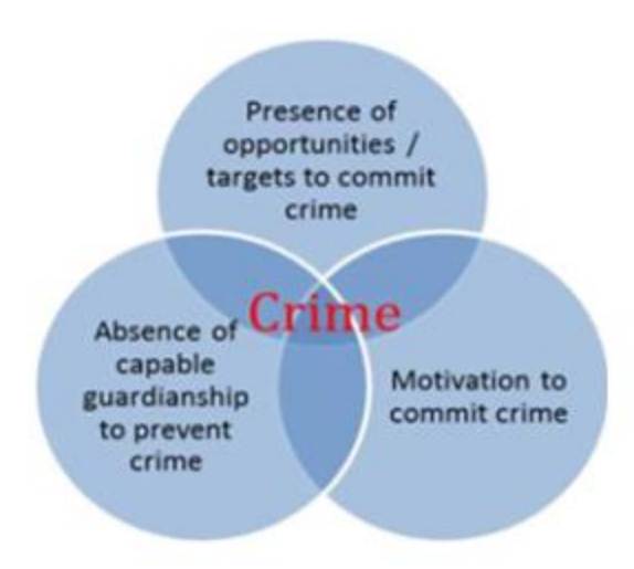
Figure 2. Routine Activity Theory in Crime

This opportunity crime theory is also known as routine activity theory. Cohen and Felson (1979) showed that structural changes in routine activity patterns can influence crime rates because of the inclusion of the following three elements as shown in the Figure 2: (1) motivation to commit crime, (2) presence of opportunities/targets to commit crime, and (3) the absence of capable guardianship to prevent crime.